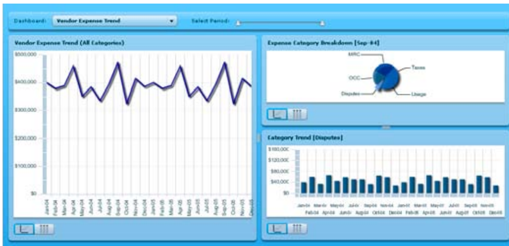
Vendor Expense Dashboard